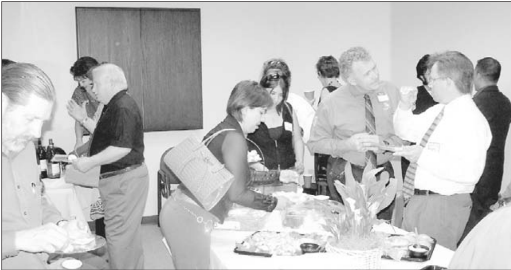
The Hispanic Chamber May mixer, hosted by the Cambridge Home Mortgage, proved to be a success.

Cambridge Home Mortgage located at 1518 Mill Rock Way hosted a great networking mixer on the warm evening of May 10. About 50 people packed the beautiful offices near the Market Place and enjoyed a couple of hours of catching up with old friends and meeting new ones getting new leads on business. That's what these networking mixers are all about.