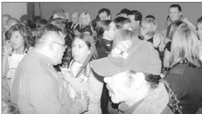
The March 9th Mixer hosted by Armijo & Lopez Advertising and Mi Casa Magazine was both well attended and unique.